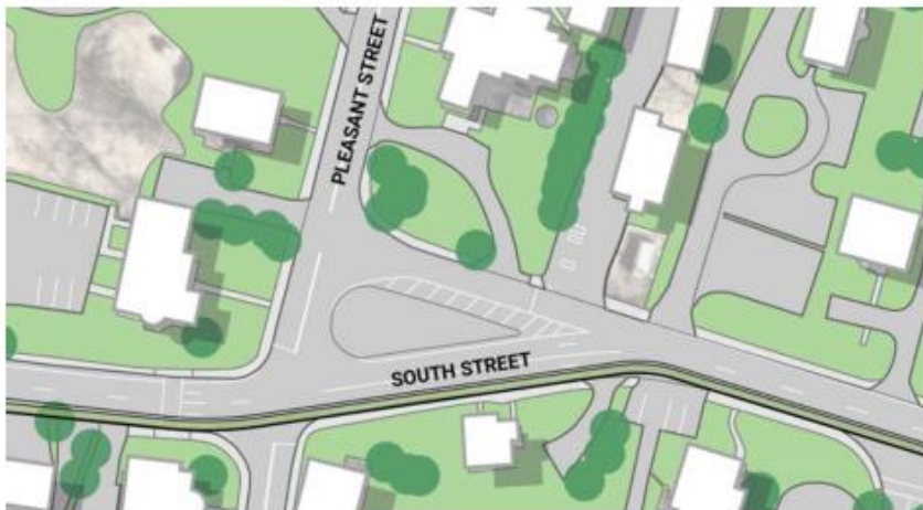
Figure 35 Existing Pleasant and South Street Intersection