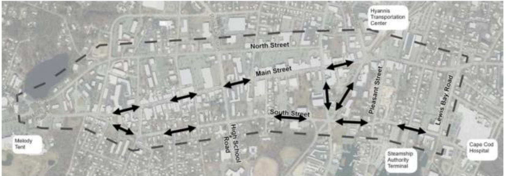
Proposed changes to street direction downtown.